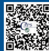
Scan the QR code to see the full report.

The survey Doing Good Index is carried out every two years in collaboration with the Centre for Asian Philanthropy and Society (CAPS). In 2021, MSD and CAPS execute the survey on the environment and participation of CSOs in promoting philanthropy in Vietnam. The report will be published in 2022.